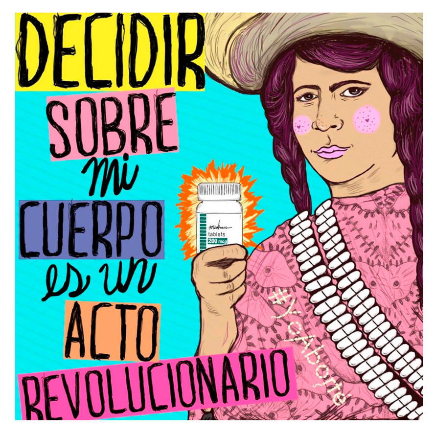
Figure 1. Image of a Mexican woman revolutionary soldier, complete with a bandolier of misoprostol tablets, shared on a feminist accompaniment group's Facebook page. The text reads: "To decide about my body is a revolutionary act" (Ddeser jóvenes Quéretaro 2019).

was viable. All of the acompañantes whom I observed and interviewed cited the WHO protocols that guide their practice. They explained the dosages required depending on the duration of the gestation period.9 Accompaniment also included talking to women about the law, their rights, how the pills worked, the physical process that would take place, how to manage pain, and what to look out for as warning signs. As women took the pills, acompañantes remained in contact to ensure that the process was completed safely and to answer any questions. Sometimes, if women were concerned about the amount of blood, they sent pictures taken on their phones so the acompañantes could reassure them that everything was proceeding as normal.