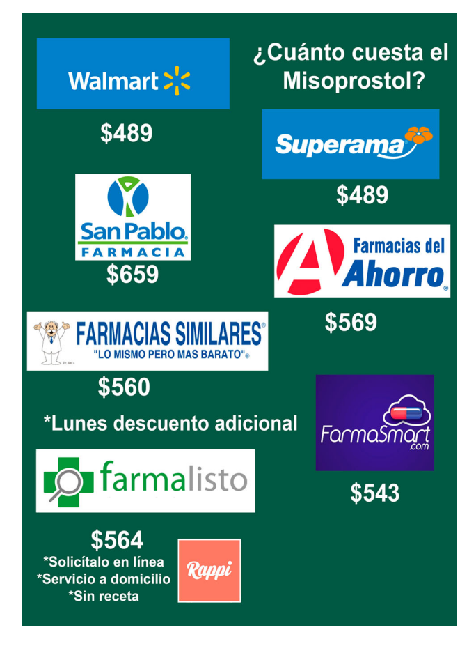
Figure 2. Image titled "How much does Misoprostol cost?" showing pharmacy and supermarket logos and corresponding prices, shared on a feminist accompaniment group's Facebook page (Socorristas y Acompañamiento Feminista LATAM 2020).

could be bought without prescription, which days had discounts, and which pharmacies were selling pills at elevated prices or refusing to sell them without a prescription. Groups acted as watchdogs, both monitoring pharmacies and sharing information that helped to keep misoprostol accessible. Figure 2 provides an example of this, showing a Facebook post by a group comparing costs of misoprostol across outlets.